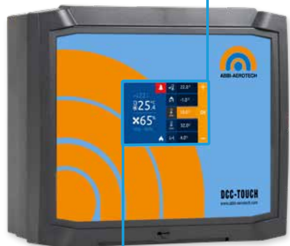
Operating hours ventilation capacity